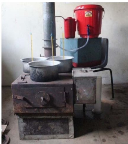
Figure 1: KU-3 Metallic Improved Cooking Stove with three potholes (MICS) and water pasteurisation system (the WAPIC).

The technical details of KU-3 are: average fuel wood burning rate 30 g/min; specific fuel consumption 391 g/l; fire power 10 kW; efficiency of microbial removal (E-coil) 100 %.